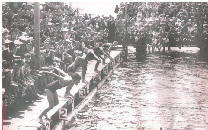
Crawley Baths Photo Credit: City of Perth Amateur SC

November 2022 saw Perth City Swimming Club move back to the home ground of Beatty Park training under its new partnership with FSC. Club members voted to revert to the historical name of the City of Perth Swimming Club to acknowledge the Club's incredible heritage during its Centenary year.